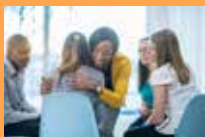
Behavioral Health/Mental Health

Today, APM employs over 300 professionals and offers a broad network of services at 14 sites throughout Eastern North Philadelphia serving over tens of thousands of culturally, ethnically and racially diverse individuals annually which has strengthened our organizational commitment to the slogan that we are "APM for Everyone".